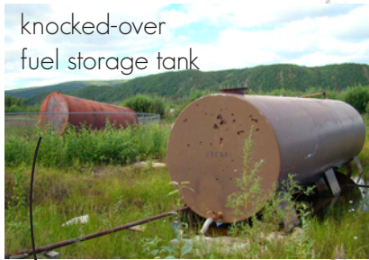
knocked-over fuel storage tank