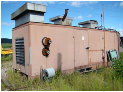
Abandoned Prefabricated Generator Building