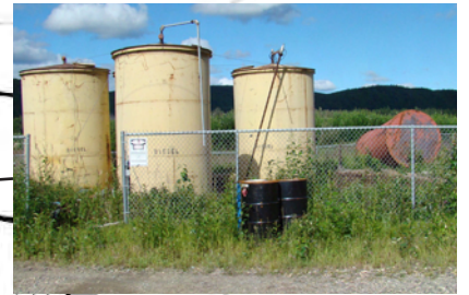
Former Tank Farm tanks